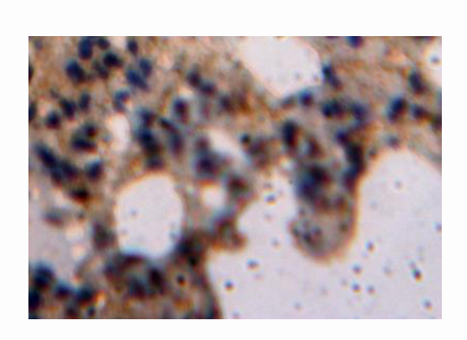
Used in DAB staining on fromalin fixed paraffin- embedded Lung tissue