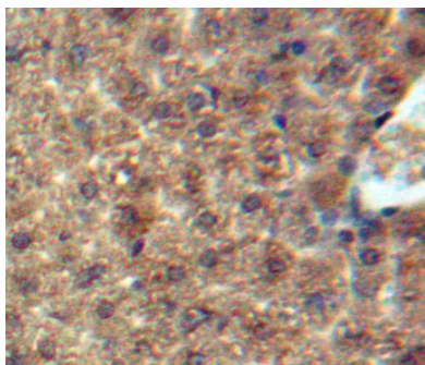
Used in DAB staining on formalin fixed paraffin- embedded Liver tissue